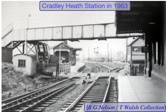
Cradley Heath Station in 1963