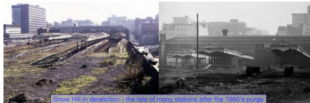
Snow Hill in dereliction - the fate of many stations after the 1960's purge