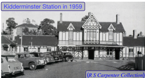
Kidderminster Station in 1959