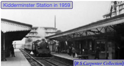
Kidderminster Station in 1959

It would not be a "temporary" structure which would become permanent, he said. A comprehensive modernisation scheme had been agreed and would be carried out as soon as the money was authorised.