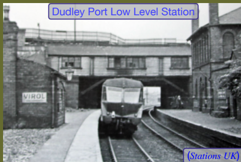
Dudley Port Low Level Station

The additional bus services referred to are: A Monday to Friday service from Walsall to Dudley Port arriving at about 7 30 a.m., and a service from Dudley Port to Walsall leaving at about 5.15 p.m.