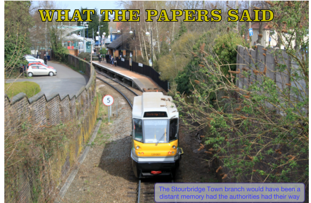
The Stourbridge Town branch would have been a distant memory had the authorities had their way