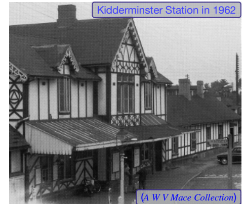
Kidderminster Station in 1962

Others have wished it the fate which almost befell the first station on the day the line was opened. A burning wad from a cannon fired during the celebrations lodged in the wooden roof over the tracks and only prompt action by men with buckets of water prevented an untimely end to a popular novelty.