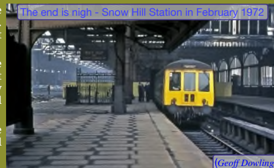
The end is high - Snow Hill Station in February 1972