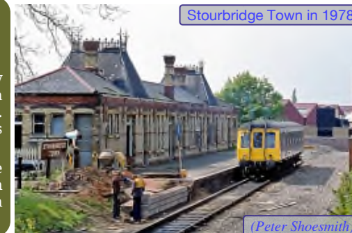
Stourbridge Town in 1978

There had been reports in the town that the rail service, which takes passengers from mainline trains at the junction to the town centre, was being replaced by buses.