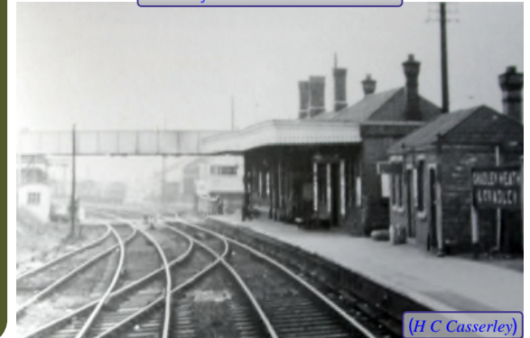
(H C Casserley)