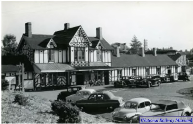
(National Railway Museum)