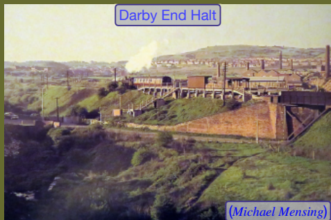
Darby End Halt

The Walsall-Dudley decision will involve the closure to passenger traffic of Wednesbury Town, Great Bridge Town, Dudley Port (Low Level) and Dudley.