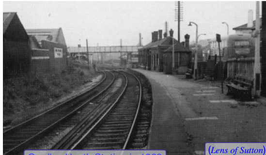
Cradley Heath Station in 1963