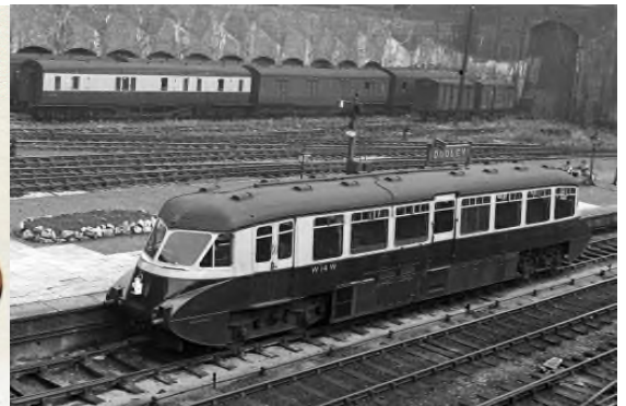
Genuine GWR Flying Banana W8W at Dudley station in 1952

However, the waters were muddied somewhat when Ecorail contacted Stourbridge Line User Group in July 2015 stating its intention to reinstate regular passenger services between Stourbridge Junction and Brierley Hill, initially via a Sunday only service to test the public reaction.