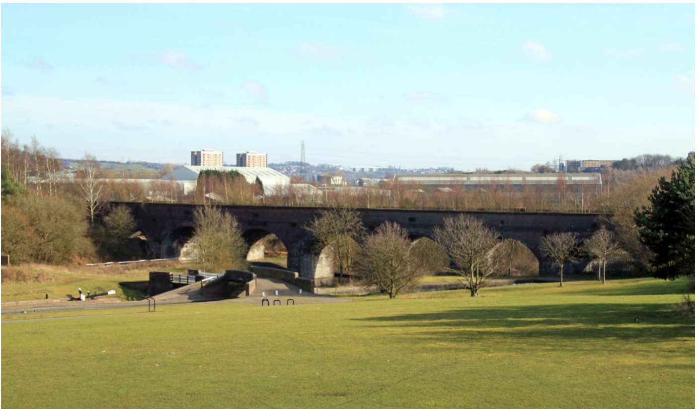
Parkhead Viaduct is one of the major structures on the line but is in very poor repair. The cost of repair is considered to be between £10 million and £20 million. If light rail is chosen, it is possible that a diversion via Russells Hall Hospital might be considered an option.