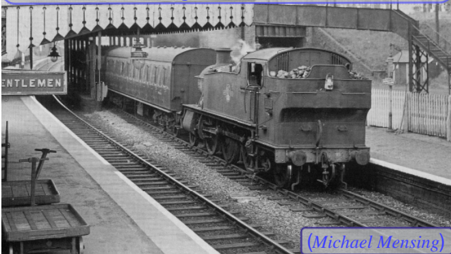
Brettell Lane Station (1962). The ex-GWR 2-6-2T locomotive is on a Wolverhampton Low Level to Stourbridge Junction service.