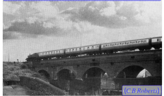
(C B Roberts)

The line closed on 6 July 1964, and this date also saw the closure of Dudley station as the Bumble Hole line had succumbed to the Beeching axe three weeks previously on 15 June. The station was demolished and, on 6 November 1967, a Freightliner terminal was opened on the land previously occupied by the ex-GWR platforms. This remained until 26 September 1989, when it was closed and the site cleared.