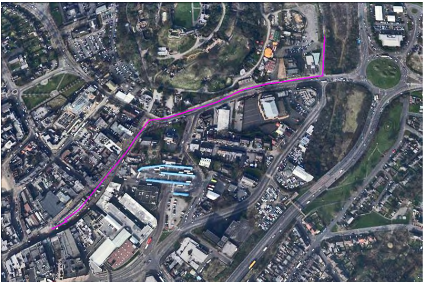
Map B - Dudley