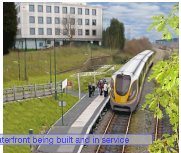
An artist's impression of the terminus at The Waterfront being built and in service

The proposal was picked up by the Stourbridge News on 11 January 2012, although details about station locations were more vague. A total cost of £5m was quoted with the stations being prefabricated and constructed on site. It was stated that £1m had been attracted from the Government's Regional Growth Fund.