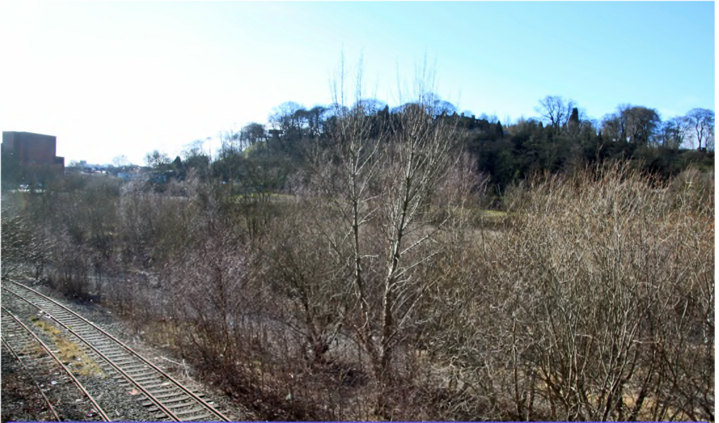
A view from Tipton road looking towards Dudley. Dudley station, the proposed site of the Dudley Ultra Light Rail project is to the left. The proposed Metro route would leave the rail line here and head past the Dudley Hippodrome site towards Dudley Bus Station.