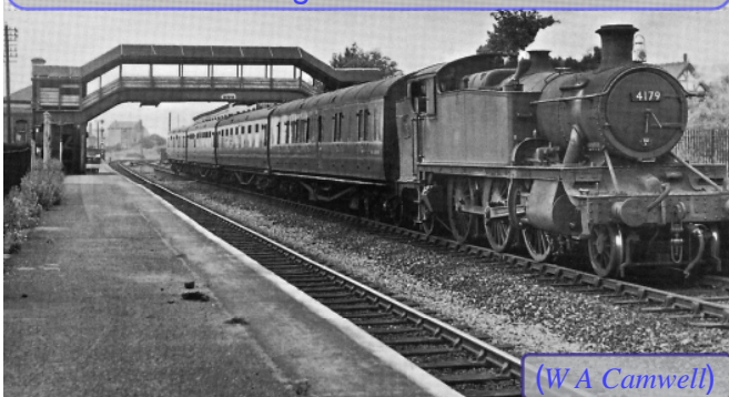
Brierley Hill Station (1958). The ex-GWR 2-6-2T locomotive is on a Wolverhampton Low Level to Stourbridge Junction service.