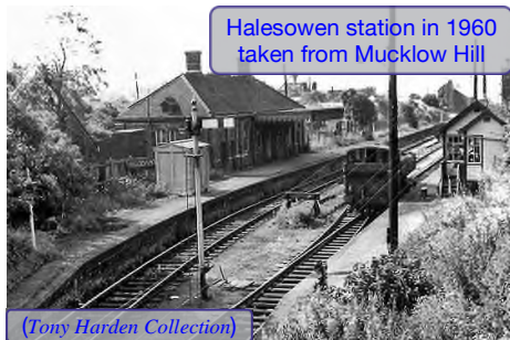
Halesowen station in 1960 taken from Mucklow Hill