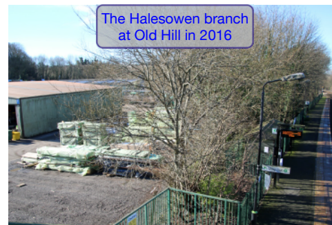
The Halesowen branch at Old Hill in 2016

Today, there is little to show that the line ever existed. The Halesowen branch platform at Old Hill is now a timber yard, while Halesowen station is now a trading estate. In the early 2000s, Centro proposed to extend Cross City line trains that terminated at Longbridge via a rebuilt line to Frankley, where there had been major housing developments. That proposal never came to fruition and has since been replaced by a project to extend all services alternately to Redditch and Bromsgrove by 2017.