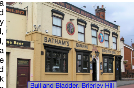
Bull and Bladder, Brierley Hill

Anybody who can remember the 1960s and 1970s will know that the large breweries monopolised the pub trade. It meant that a major proportion of beer sales was shared amongst the insipid keg beers produced by these major breweries - Watney's Red Barrel, Courage Tavern Keg, Whitbread Tankard, Worthington E and Double Diamond to name a few. The West Midlands were more fortunate than many areas in having a number of good independent breweries producing cask conditioned ales. However, the past few years has seen many small independent breweries created and the area around the Stourbridge line has witnessed a fair few of these. The following article details the independent breweries along the line.