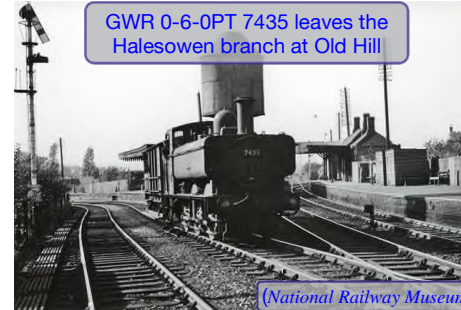
GWR 0-6-0PT 7435 leaves the Halesowen branch at Old Hill

The line to Halesowen left the line from Birmingham to Stourbridge just to the east of Old Hill station and accessed a platform face behind the current Stourbridge-bound platform which curved to the left on the site of the current timber yard. The line ran downhill at 1 in 50 to the 151 yards long Haden Hill tunnel before emerging and running parallel to and just to the east of the A459 Dudley to Halesowen Road.