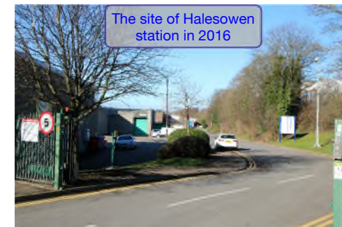
The site of Halesowen station in 2016