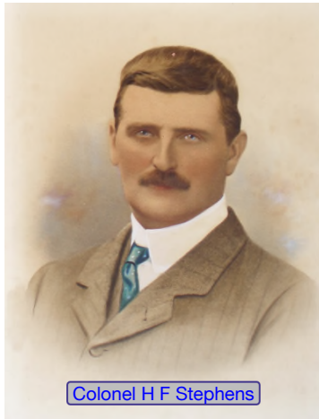
Colonel H F Stephens

The Colonel's passion was to provide transport to rural areas and part of his strategy was to convert freight lines to passenger use. A good example was the Ashover Light Railway, opened in 1924 and built primarily to carry stone. In 1925, this narrow gauge railway (1ft 11½") began to carry passengers but this traffic ceased in 1936. Such was the nature of rural transport because the British rail network was saturated, following the surge of competitive companies building duplicate end to end routes without regard to the sparse populations in between and limited incomes of potential passengers.