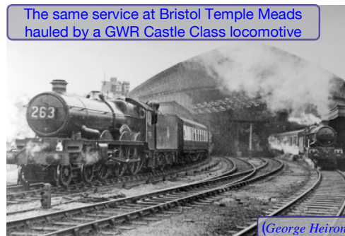
The same service at Bristol Temple Meads hauled by a GWR Castle Class locomotive