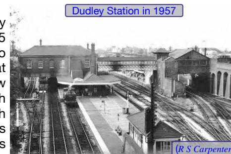
Dudley Station in 1957

The final passenger services through Dudley ran on 27 February 1967 with the 0855 service from Plymouth being scheduled to be the last one to pass through the station at about 2.45 pm. The following Sunday saw Wolverhampton Low Level, along with Birmingham Snow Hill, lose all of its through services with just all-stations local services to Snow Hill remaining. Incidentally, this was also the day that Stourbridge line trains were routed into New Street.