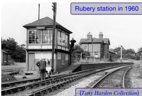
Rubery station in 1960

The 1960s saw the complete closure of the line in stages. The Halesowen to Rubery section closed completely on 6 January 1964, with the Rubery to Longbridge Works section following on 6 July 1964. April 1965 saw the track between Halesowen and Longbridge Works lifted and Dowery Dell Viaduct demolished. The section between Old Hill and Halesowen, including the Halesowen Basin branch closed on 1 October 1969.