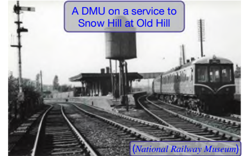
A DMU on a service to Snow Hill at Old Hill