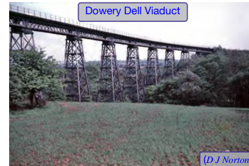
Dowery Dell Viaduct

Between Old Hill and Halesowen, a branch goods line was opened on 2 April 1902 which enabled trains from Halesowen to branch to the right and serve Coombes Wood Colliery and Halesowen Basin, a goods shed being built at the latter. Three years later, on 1 July 1905, an intermediate halt named Coombes Holloway Halt was built close to Coombes Road. The original platform was on the east side of the line, but in 1914, it was moved to the west side to enable a connecting line to the Halesowen Basin line from the Old Hill direction. By 1906, the Old Hill to Halesowen service had increased to 25 trains in each direction on Mondays to Saturdays and 13 in each direction on Sundays.