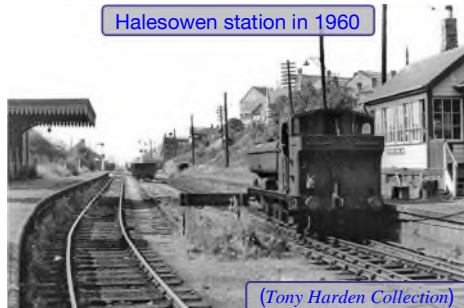
Halesowen station in 1960