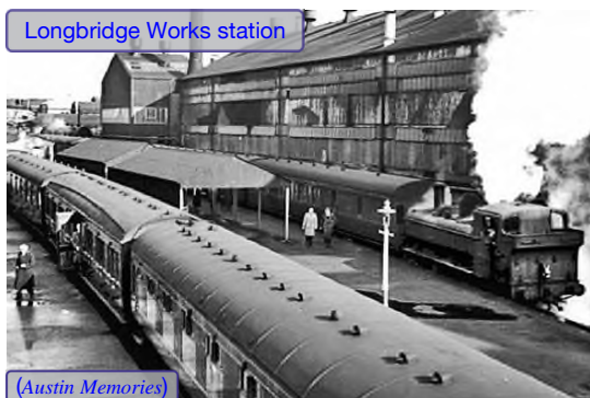
Longbridge Works station

However, regular passenger services between Old Hill and Halesowen were to last only another five years and were withdrawn on 5 December 1927, with Coombes Holloway Halt closing completely. The GWR replaced the train service with their own bus service between Old Hill and Halesowen on the same day, proving that substitution is not a modern trend.