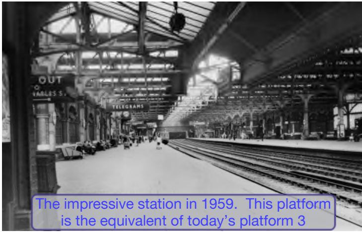
The impressive station in 1959. This platform is the equivalent of today's platform 3

Various ingenious solutions were mooted including an underground station below New Street and a completely new station in Birmingham's Heartlands. WMPTE had always envisaged another cross-city line from Leamington Spa to Worcester via Stourbridge. To route it through Birmingham New Street at that time would have added to capacity problems. The obvious solution was to