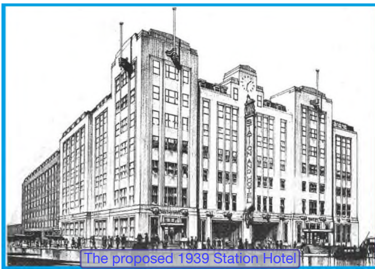
The proposed 1939 Station Hotel

It is fair to assume that a sturdy functional new building would have been erected if not for the outbreak of World War 2. During the conflict, the familiar frontage of Chatwin's Snow Hill was virtually unscathed by bombs and internal damage was treatable. What if Hitler's bombs had obliterated Snow Hill? Despite the financial state of the GWR, would it have been cheaper to rebuild in the new style?