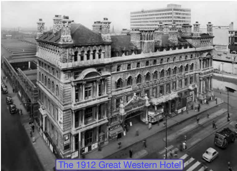
The 1912 Great Western Hotel