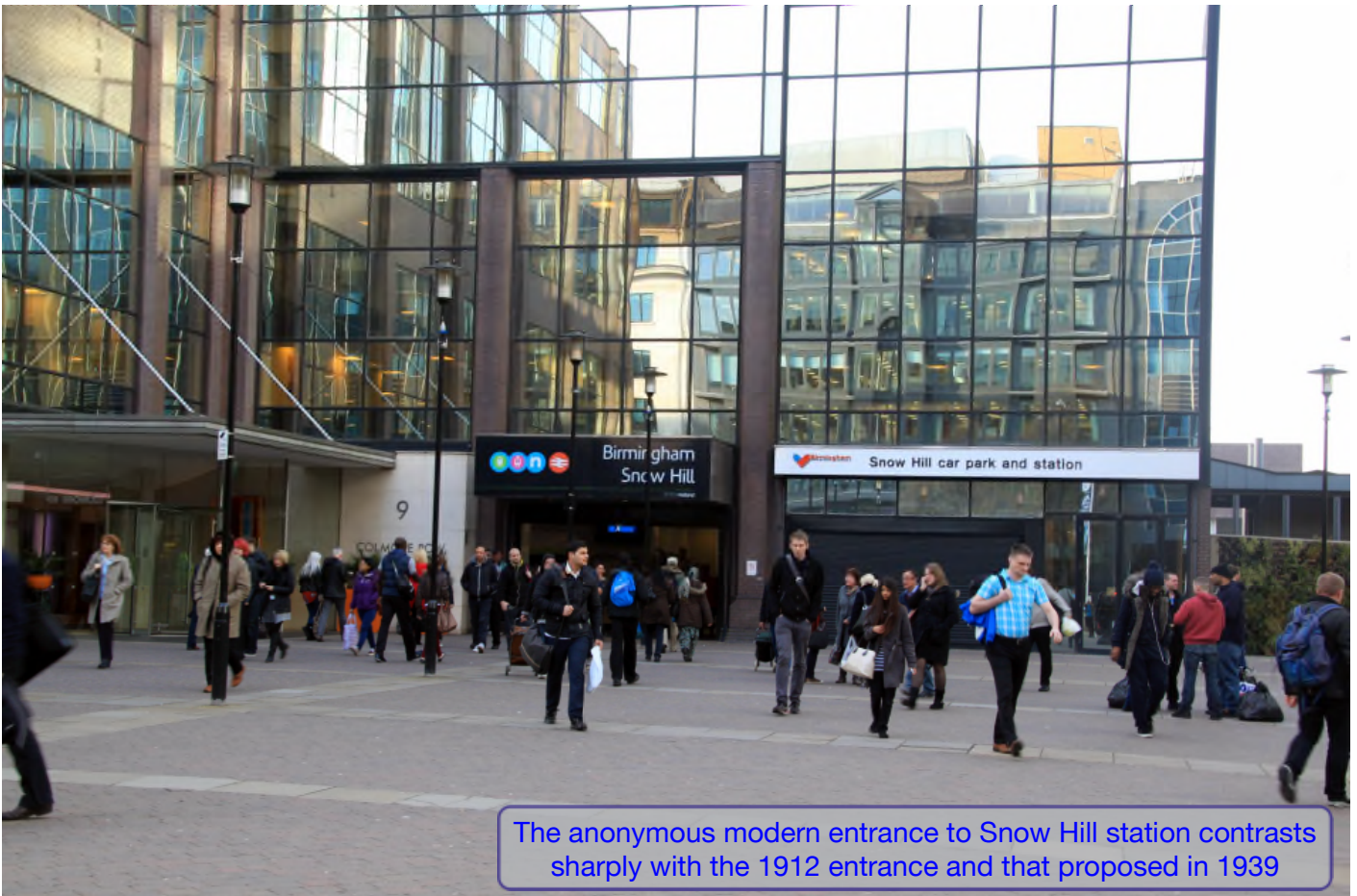
The anonymous modern entrance to Snow Hill station contrasts sharply with the 1912 entrance and that proposed in 1939