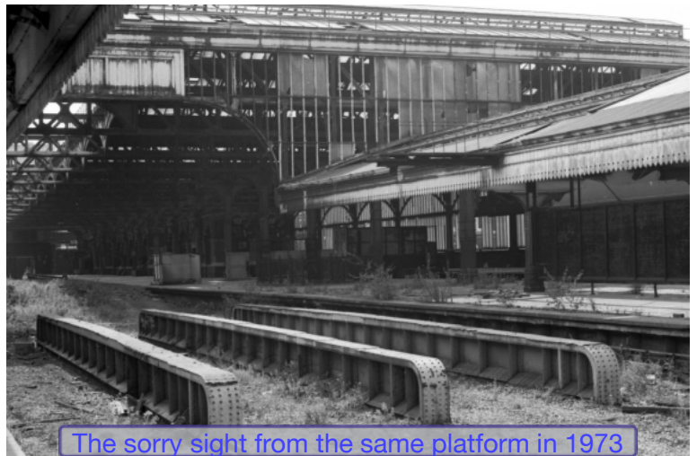
The sorry sight from the same platform in 1973

There was an even better reason for a Snow Hill Cross-City line which was to restore another corridor to London and the south east. The franchising system was created by the Railways Act 1993 as part of the privatisation of British Rail by the Government of John Major and the first franchises came into effect in 1996. Re-opening Birmingham Snow Hill station and the tunnel beneath the city, meant that a