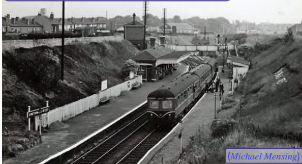
A Birmingham to Cardiff service stops at Smethwick West (previously Smethwick Junction) in 1960. The station closed in 1996.

By the start of the 20th century, the services had been greatly improved and named "The South Wales Expresses". There were four services in each direction. The southbound services left Snow Hill at 1015, 1138, 1555 and 1750, the first running non-stop between Snow Hill and Stourbridge Junction while the last three also stopped at Smethwick Junction (latterly Smethwick West). Two of the northbound services also