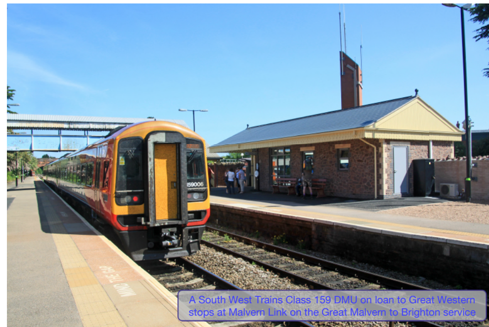
A South West Trains Class 159 DMU on loan to Great Western stops at Malvern Link on the Great Malvern to Brighton service