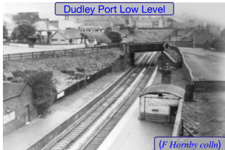
Dudley Port Low Level