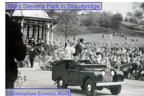
Mary Stevens Park in Stourbridge

The red carpet at Hagley station came from British Railways Stores at Paddington and was the one regularly used for ceremonial occasions. After use at Hagley, it was rolled up and dispatched to Kidderminster for use in the evening, much to the chagrin of many Kidderminster residents who felt that the town produced its own quality carpets and that one of those should have been used instead.