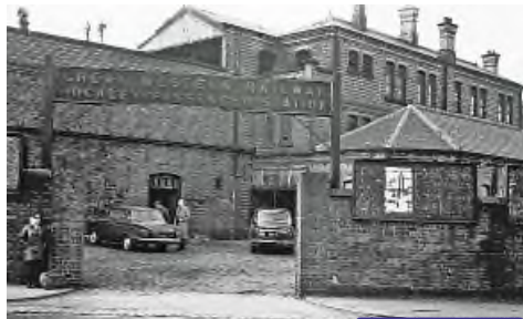
Hockley station building