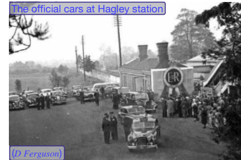
The official cars at Hagley station

The Queen and the Duke of Edinburgh then left by car for a tour that took them to Halesowen, Oldbury, Rowley Regis, Dudley (for lunch at the Town Hall), Brierley Hill and Stourbridge (Mary Stevens Park), before they went on to Kidderminster.