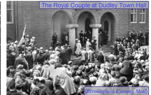
The Royal Couple at Dudley Town Hall