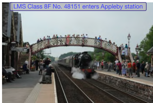
LMS Class 8F No. 48151 enters Appleby station

Not all stations on the line have re-opened since 1986 and my guide book pointed out the locations of some buildings which have survived but are not in use, such as Little Salkeld. Sadly, some railway buildings have been demolished and lost forever. Among the victims are Cotehill and Crosby Garrett but these were eliminated as far back as 1952.