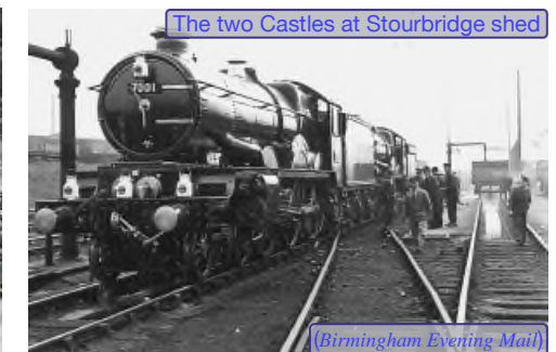
The two Castles at Stourbridge shed