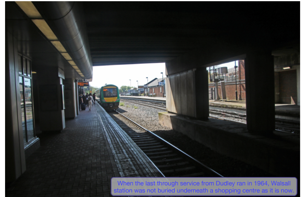
When the last through service from Dudley ran in 1964, Walsall station was not buried underneath a shopping centre as it is now.