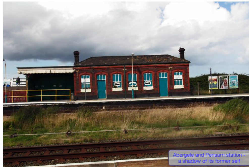
Abergele and Pensarn station - a shadow of its former self