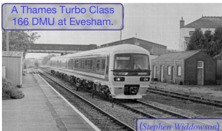
A Thames Turbo Class 166 DMU at Evesham.

The story now fasts forward 28 years to October 1993 when Network South East announced a new "Thames Turbo" service. The southbound service ran as follows :- Birmingham New Street (0900), Cradley Heath (0914), Stourbridge Junction (0920), Kidderminster (0929), Droitwich Spa (0940), Worcester Shrub Hill (0955), Pershore (1003), Evesham (1012), Moreton-in-Marsh (1027),