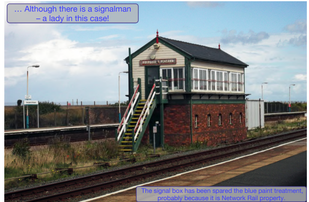
The signal box has been spared the blue paint treatment, probably because it is Network Rail property.