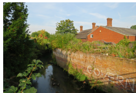
The River Stour viewed from the small bridge connecting Amblecote High Street to Lower High Street in Stourbridge

A very unassuming bridge connects Amblecote High Street and Stourbridge High Street. This is the bridge over the River Stour which gives the town its name. Local history website Stourbridge.com features a map showing its course. The guide accompanying the map also refers to the river being made navigable by Mr Andrew Yarranton in 1665. He built "flash locks" but they were destroyed twenty years later by floods. Mr Yarranton ran out of money and it is unlikely that anyone else invested in a wharf.