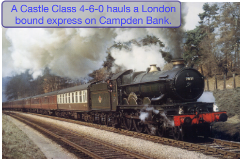
A Castle Class 4-6-0 hauls a London bound express on Campden Bank.

By 1955, two journeys from Paddington at 1345 and 1645 still reached Stourbridge Junction, the latter journey terminating at Stourbridge Junction. However, only 1 southbound journey remained at 1425 from Wolverhampton. The Sunday service remained as it was in 1947, with one journey in each direction between Paddington and Wolverhampton, although the southbound journey that left