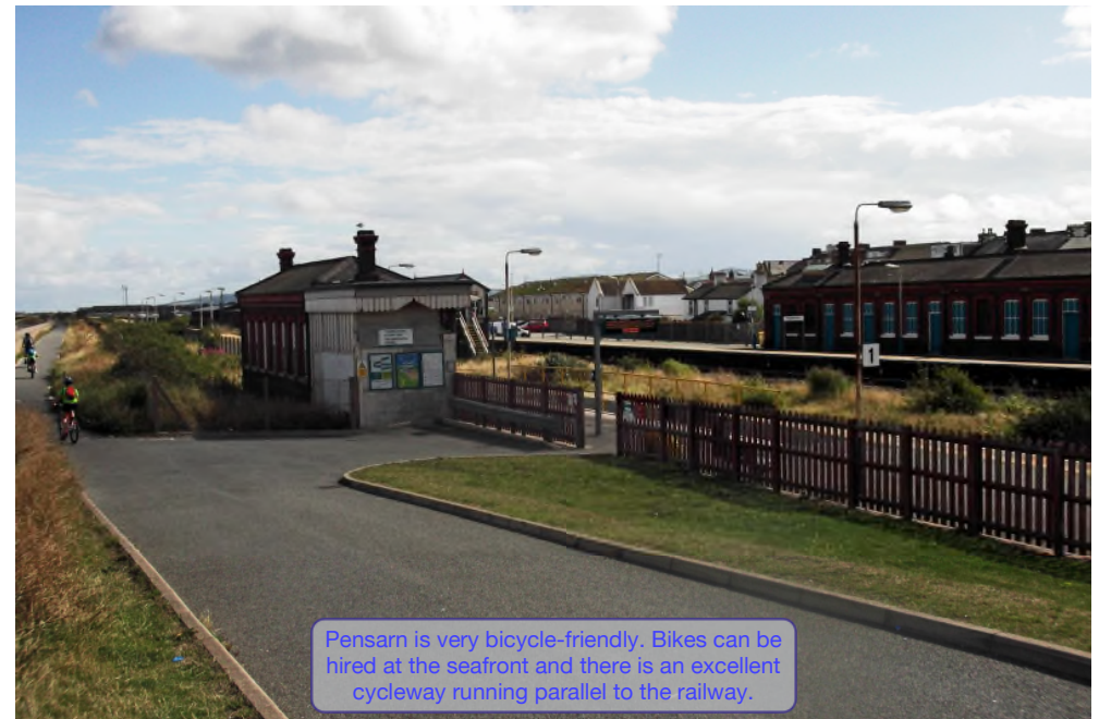
Pensarn is very bicycle-friendly. Bikes can be hired at the seafront and there is an excellent cycleway running parallel to the railway.