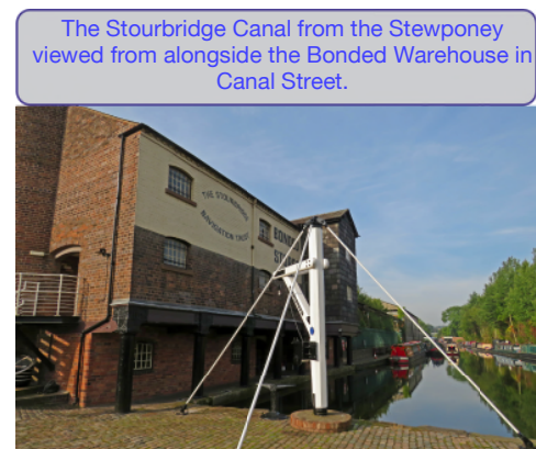
The Stourbridge Canal from the Stewponey viewed from alongside the Bonded Warehouse in Canal Street.

Another watercourse was to take over: The canal from Stewponey was authorised in 1776, but finished/began west of Lower High Street. An extension under the road came in the 1830s to serve an ironworks.