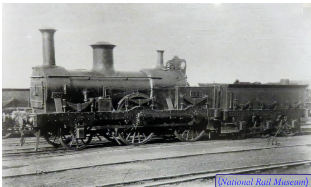
OWW no 1 "Hawthorn" was the first locomotive delivered new to the OWW. It was renumbered 171 when the GWR took over the line. It was scrapped in 1885

By 1857, four through trains operated in each direction. Two of the northbound trains from Euston terminated at Wolverhampton Queen Street while the other two terminated at the OWWR's Wolverhampton Low Level station. There was one southbound service from Queen Street and three from Low Level. Journey times were pedestrian by today's standards. One train in each direction was designated an express train with journey times of 4½ hours between Kidderminster and Euston and 4¾ hours between Stourbridge and Euston, while the remainder of the journeys took between 5¼ and 6½ hours between Stourbridge and Euston.